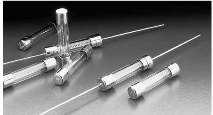
312 000 Series